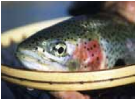
Table 38 summarizes net economic value generated by anglers fishing for NFH-produced and stocked rainbow trout. Almost $198 million in net economic value is generated by the hatcheries. Region 4 contributes $139.3 million in net economic value, Region 6 almost $45.1 million, Region 3 $8.2 million and Region 2 $5.4 million.